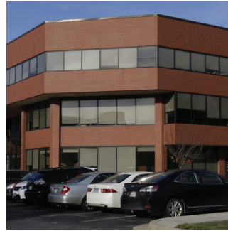
9640 Medical Ctr I | ROCKVILLE, MD ONCO4 - 34,459 SF - BIOTECH