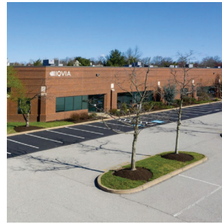
550 Blair Mill I | HORSHAM, PA 100,000 +/- SF BIOTECH