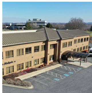
140 Thomas Johnson I | FREDERICK, MD 20,436 SF - MEDICAL