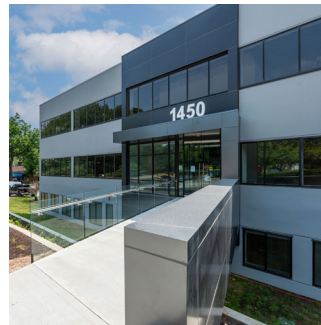
1450 Research I | ROCKVILLE, MD 60,000 +/- SF BIOTECH