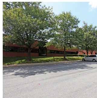
9900 Medical Center I | ROCKVILLE, MD 16,482 SF - BIOTECH