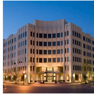
800 King Farm I | ROCKVILLE, MD ARCELLX - 57,092 SF - BIOTECH