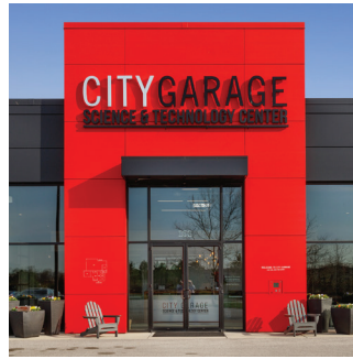
City Garage I | BALTIMORE, MD 100,000 +/- SF BIOTECH