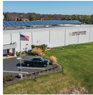
1850 Gravers I | PLYMOUTH MEETING, PA 100,000 +/- SF BIOTECH