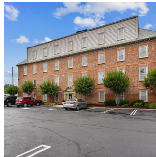
600 S Frederick Ave I GAITHERSBURG, MD 43,144 SF, OFFICE/MEDICAL