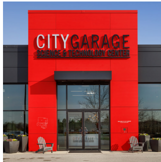
City Garage I BALTIMORE, MD 100,000 +/- SF, OFFICE/MEDICAL