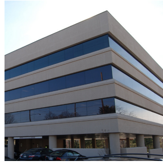
438 N Frederick Ave I GAITHERSBURG, MD 100,000 +/- SF, OFFICE/CONDOS