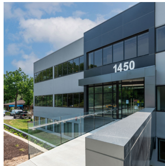
1450 Research Blvd I ROCKVILLE, MD 60,000 +/- SF, OFFICE/MEDICAL