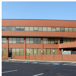
9600 Medical Ctr I ROCKVILLE, MD HANSOH BIO - 17,500 SF, OFFICE/MEDICAL