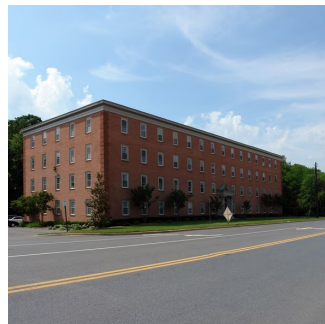
604 S Frederick Ave I GAITHERSBURG, MD 45,024 SF, OFFICE/MEDICAL