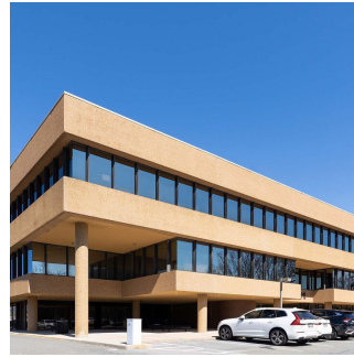
6101 Executive Blvd I ROCKVILLE, MD ARCELLX - 79,036 SF, OFFICE/MEDICAL