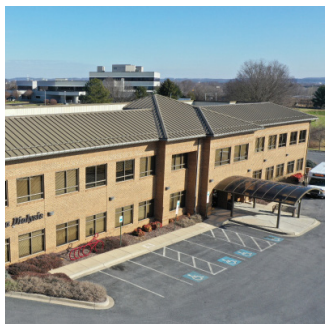
140 Thomas Johnson Dr I FREDERICK, MD 20,436 SF, OFFICE/MEDICAL