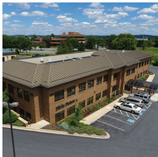
140 Thomas Johnson Dr I FREDERICK, MD 20,436 SF, OFFICE/MEDICAL